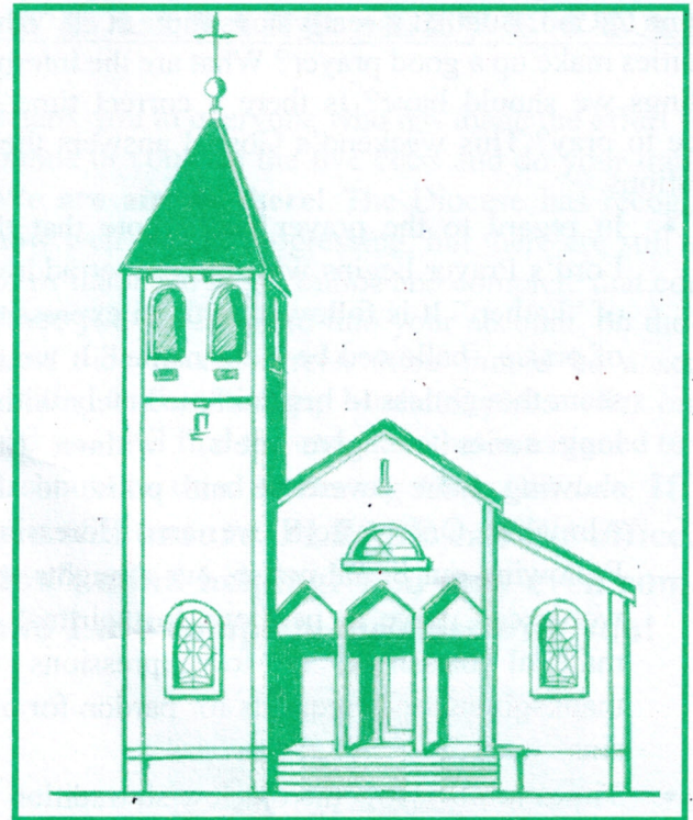
St. Patrick Mission, Port Costa

PASTORAL CARE OF THE SICK: Notify the priest regarding those who are ill, hospitalized or homebound.