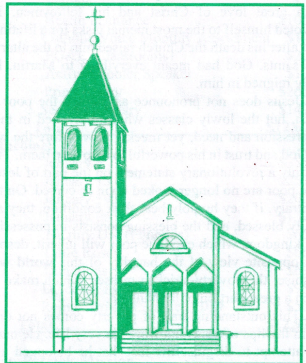
St. Patrick Mission, Port Costa

PASTORAL CARE OF THE SICK: Notify the priest regarding those who are ill, hospitalized or homebound.