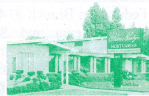
Wilson & Kratzer Chapel of the Mission Bells - FD 881 (510) 232-6552