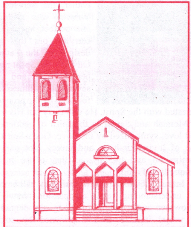
St. Patrick Mission, Port Costa

PASTORAL CARE OF THE SICK: Notify the priest regarding those who are ill, hospitalized or homebound.